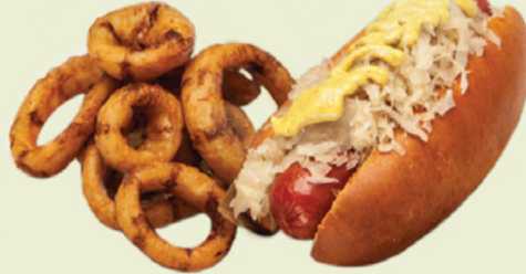
O-Rings and NY Dog. Sold Separately.